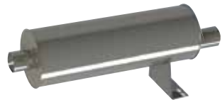
Muffler with Catalyst